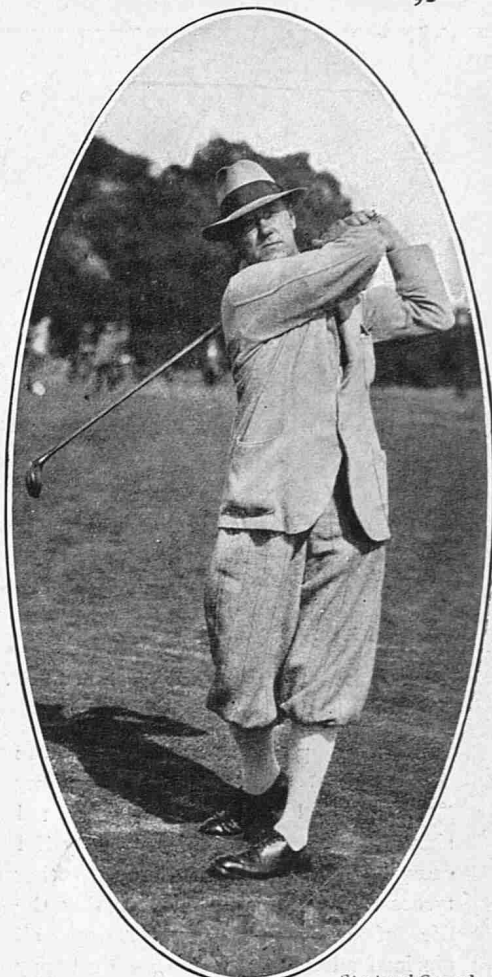
Sport and General